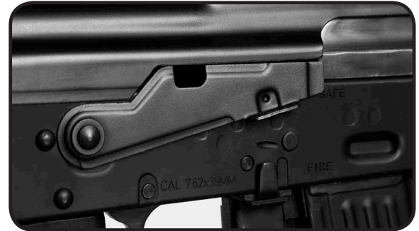
Picture #2 SAFETY ENGAGED! Bolt is covered and the trigger is blocked from full travel. FIRE DISABLED!

Bolt handle , external part of bolt assembly is located on right hand side, and it’s used for pulling the bolt rearward. When bolt handle is drawn backwards, a cartridge gets stripped from the top of the magazine and loaded into the firing chamber. While traveling backwards, bolt assembly also cocks the hammer, making the rifle ready to fire. Drawing the bolt handle back is also being used for checking the firing chamber condition and for manually ejecting cartridges in cases of misfire or jams . (picture 3.)