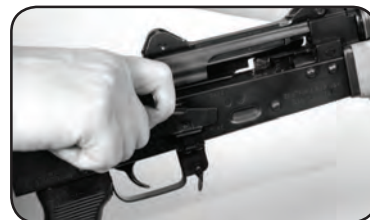
Picture #7 Pull Bolt charging handle all the way back to expose the chamber