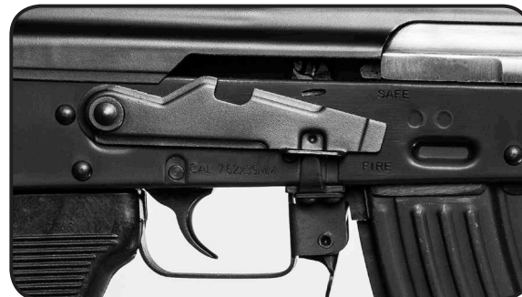
Picture #4 Safety disengaged! Bolt is fully exposed and the trigger has full travel. FIRE ENABLED!

CAUTION: TO AVOID INJURIES DURING FIRING, ALWAYS KEEP YOUR FINGERS AND OTHER PARTS OF YOUR BODY AWAY FROM THE COCKING HANDLE AND FROM THE EJECTION PORT.