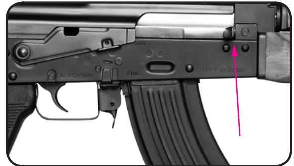
Picture #3 Bolt (cocking) handle is located on right-hand side of the firearm used for pulling bolt rearward.