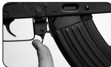
Picture #6 RELEASE MAGAZINE by pressing the magazine release lever forward

If this technique does not help, slowly return the bolt cocking handle to initial (home) position. Return it slowly to forward position, without allowing it to impact the back of the cartridge casing. Disassemble the firearm by following the instructions from FIELD STRIPPING chapter(5.1), to safely remove the cartridge. If you are still unable to remove the cartridge casing after field stripping procedure, do not reassemble the rifle! Take it to authorized repair shop or consult qualified gunsmith. If your firearm has been clear of any dirt, oil and foreign objects, you may proceed with loading procedure.