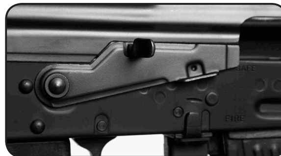
Picture #5 BOLT CATCH - Safety engaged! Bolt is exposed, blocked and the trigger is blocked from full travel. FIRE DISABLED!