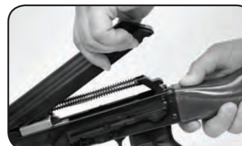
Picture #12 Raising the dust cover

USE PROTECTIVE EYEWEAR TO PREVENT EYE INJURIES! POINT MUZZLE IN SAFE DIRECTION!